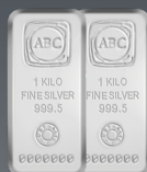
1KG SILVER BARS