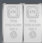
5KG SILVER BARS